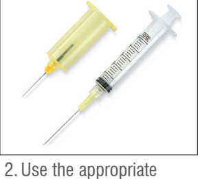
2. Use the appropriate sample collection device.

<sup>†</sup>When using an evacuated tube, such as a Vacutainer* tube, allow the sample to draw naturally into the tube by vacuum